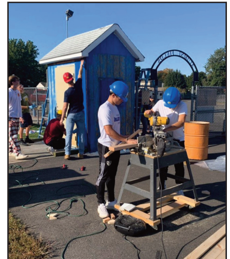
Students refurbished the Plainville High School's ticket booth on the October 7th Learning Adventure Day.

If you, or your company / organization would like to participate in the December 16th Learning Adventure Day, either on-site at Plainville High School or hosting a group of students at your location, please contact: